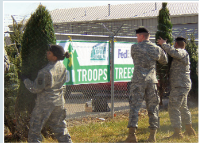
Trees for Troops at Fort Campbell, 2005.

To bolster the spirit of Christmas, Drake & Company and NCTA launched Trees for Troops, a cause marketing campaign that delivers Real Christmas Trees to U.S. military families. With the support of FedEx, in three years the program has delivered some 33,000 trees and has grown to include 850 donors.